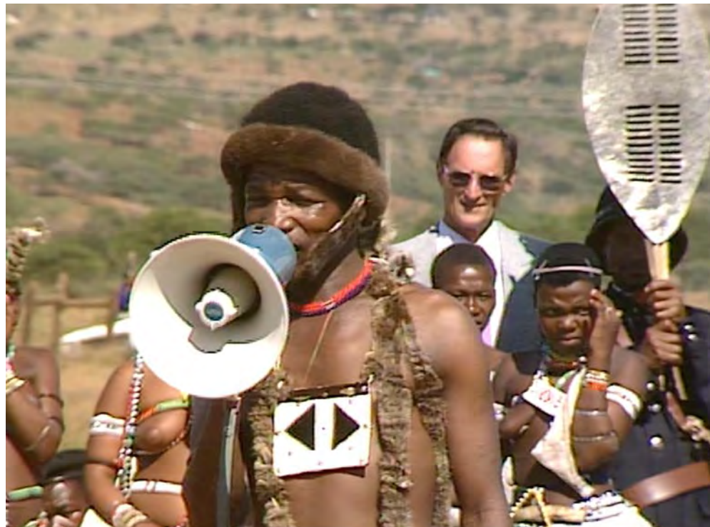
Johnny Clegg Traditonal Wedding