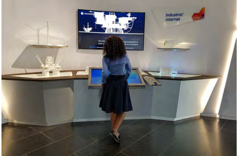
Interior design Art and Design Commissions Digital Exhibition Curation Workshop Conception Facilitation Management.