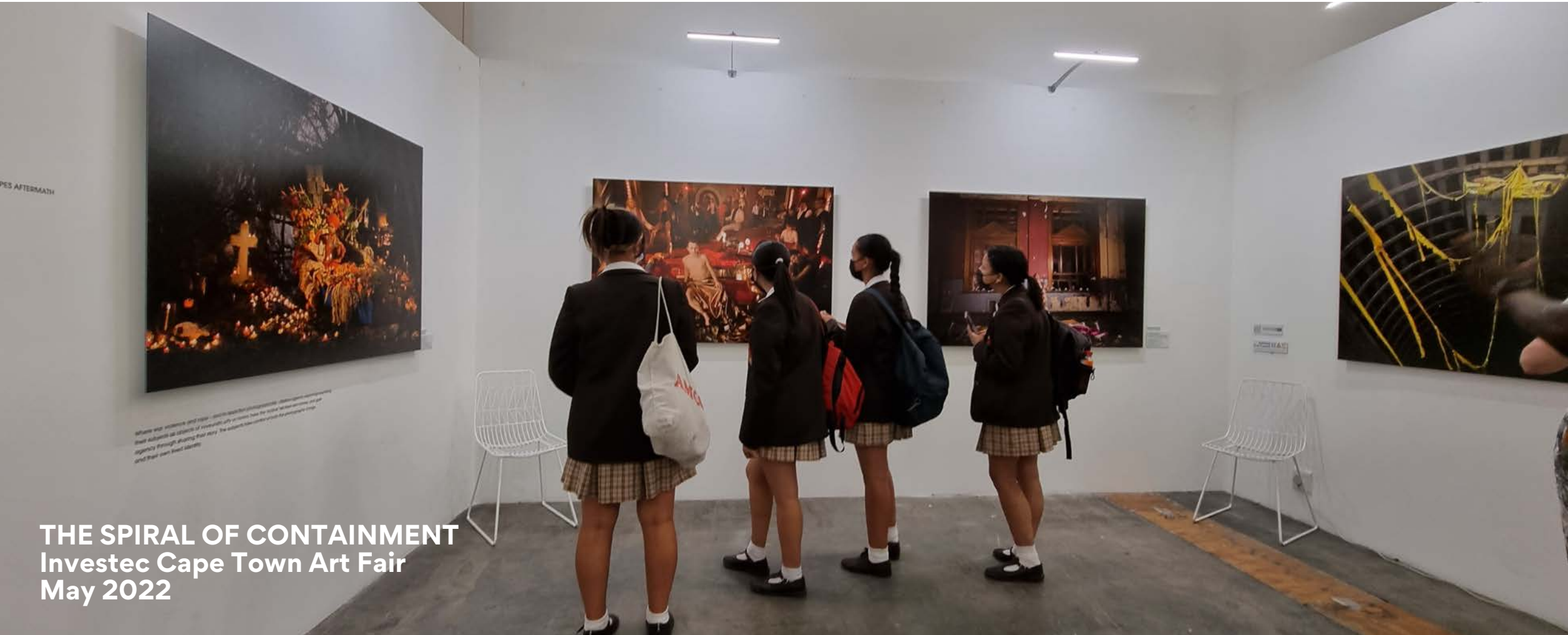
THE SPIRAL OF CONTAINMENT Investec Cape Town Art Fair May 2022

Collection Development, Curation, and Exhibition: Public and Private collections. On all platforms.