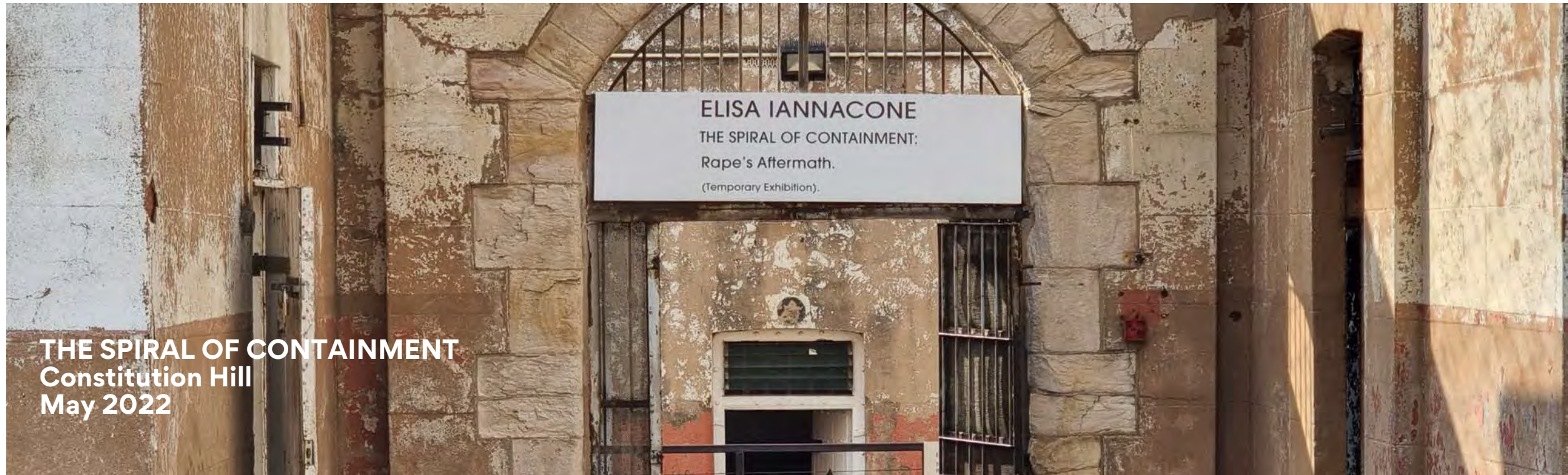
THE SPIRAL OF CONTAINMENT Constitution Hill May 2022

Collection Development, Curation, and Exhibition: Public and Private collections. On all platforms.