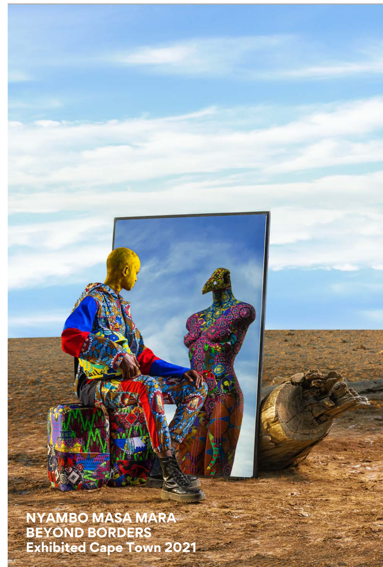
NYAMBO MASA MARA BEYOND BORDERS Exhibited Cape Town 2021