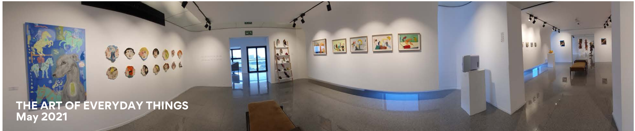
THE ART OF EVERYDAY THINGS May 2021

Collection Development, Curation, and Exhibition: Public and Private collections. On all platforms.