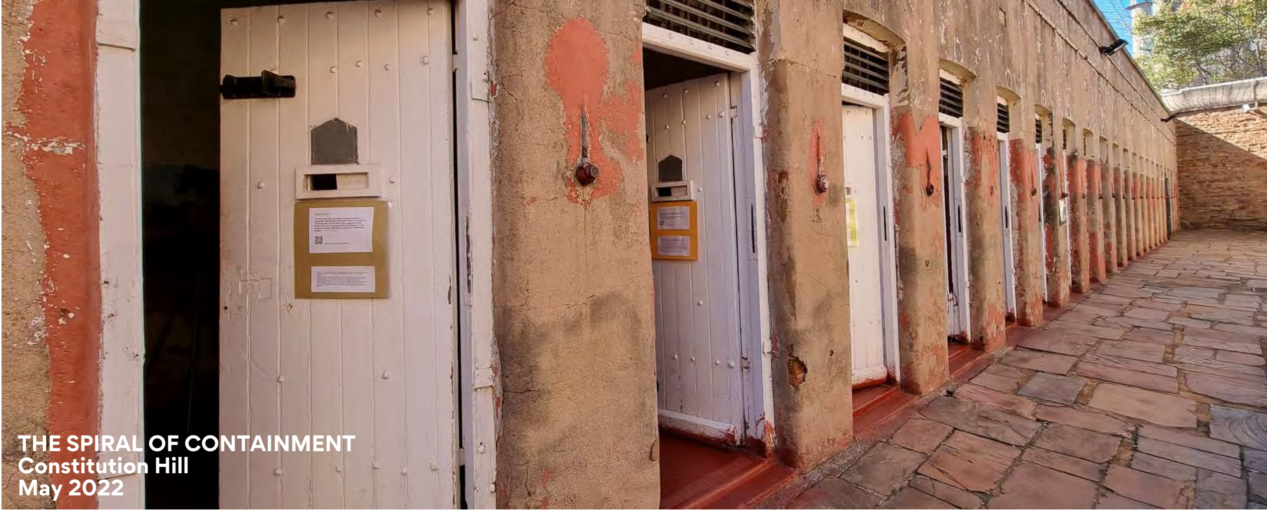
THE SPIRAL OF CONTAINMENT Constitution Hill May 2022

Collection Development, Curation, and Exhibition: Public and Private collections. On all platforms.