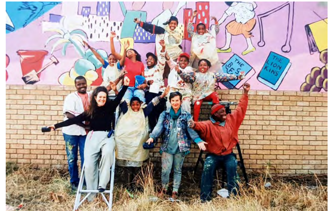
Sponsored Child Murals in major townships across South Africa 1996 Alexander Township Kathlehong Soweto