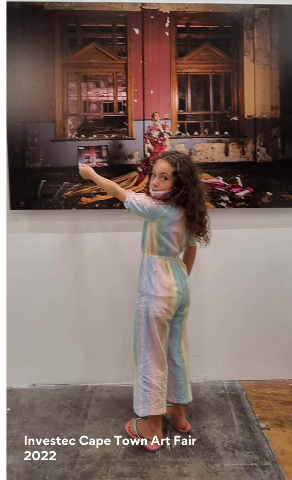
Investec Cape Town Art Fair 2022