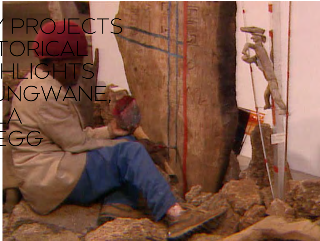
Television programmes 1980 to 1996 Print and Radio 1980 on