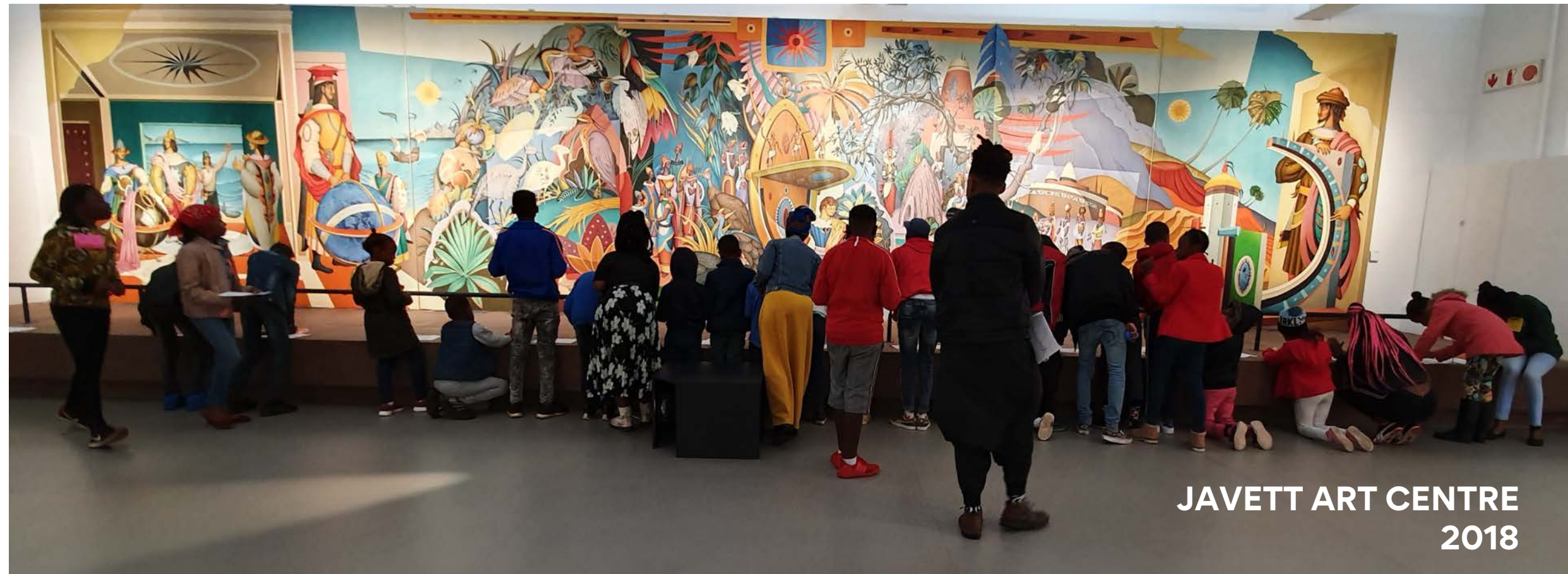
JAVETT ART CENTRE 2018

And request a visit to our historical multi-media archives (Art Institute South Africa)