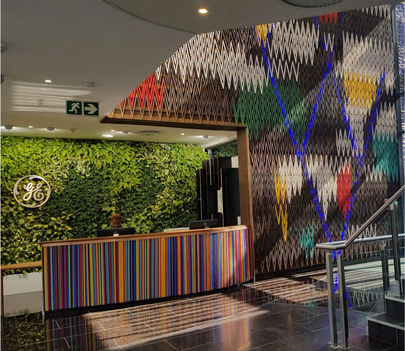
Gordon Institute of Business Science 2014 - 2016 GE Africa Innovation Centre 2016 - 2018 (seen here)