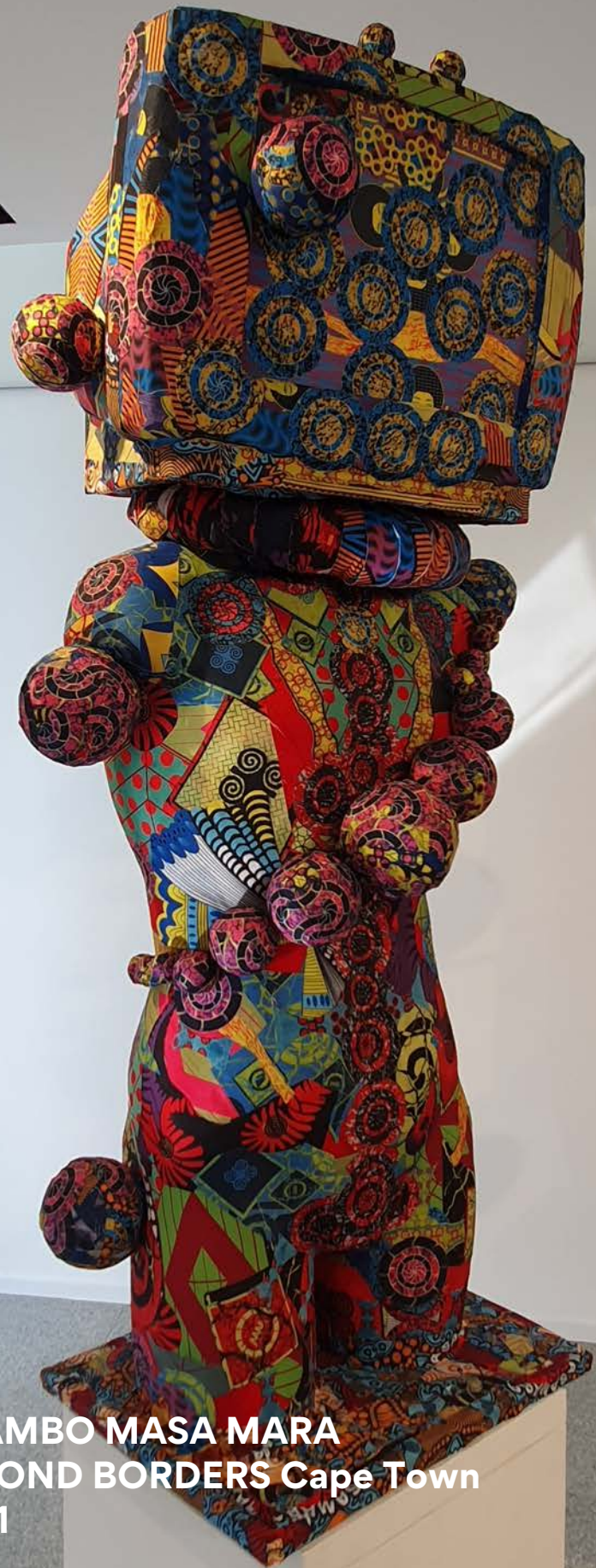
NYAMBO MASA MARA BEYOND BORDERS Cape Town 2021